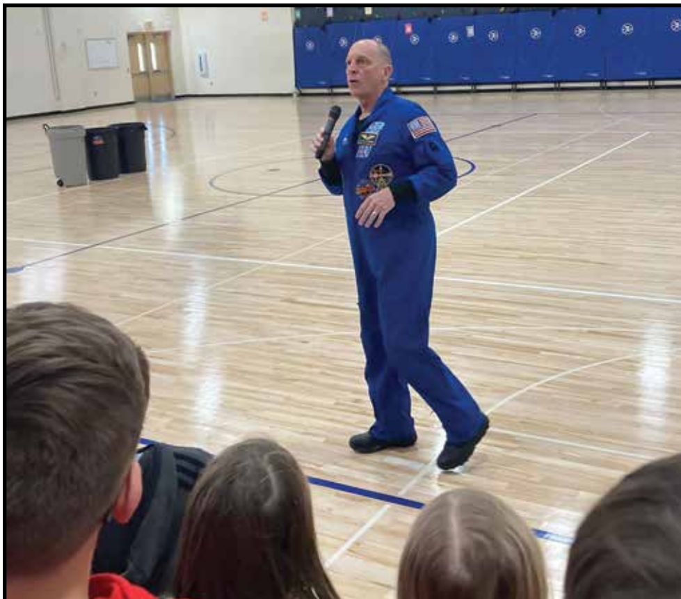
Astronaut Clayton Anderson amazed our 3rd and 4th graders with stories from space.

It will be posted on Friday before the Board Meetings, which is the second Monday of each month.